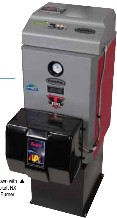
Shown with ▲ Beckett NX Oil Burner