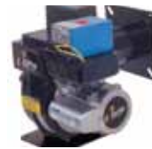
▲ Carlin EZ Oil Burner