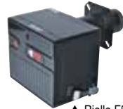
▲ Riello F5 Oil Burner