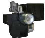
▲ Heat Wise SU2A Gas Burner