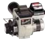
▲ Beckett AFG Oil Burner